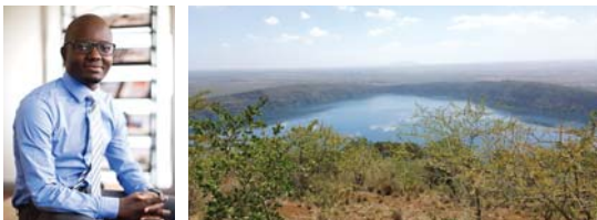
Samwel Ndandala Manager - International Tax and Transfer Pricing

Description of picture: On Mount Kilimanjaro's leeward side, right at the border with Kenya, is a hidden gem, Lake Chala. It will take you a good half hour to descend the steep 100 metre crater rim onto its shores, with the purest of waters that flow directly from Kilimanjaro's underground streams. Apparently, there are no more crocodiles there - even so, if you'd like to take a dip, better be a good swimmer, as the caldera crater is 90 metres deep!