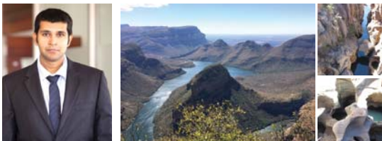
Ali Dawoodbhai Associate Director - International Tax and Transfer Pricing

Description of picture: All three photos are from the Blyde River Canyon Nature Reserve which is situated in the Drakensberg escarpment region of eastern Mpumalanga, South Africa. The canyon is the third largest in the world. The Bourke's Luck Potholes is a spectacular pattern and rock formations caused by centuries of water erosion and the views in the canyon are breathtaking. The walk up to the top was definitely worth the reward of the sight and the view of the landscape.